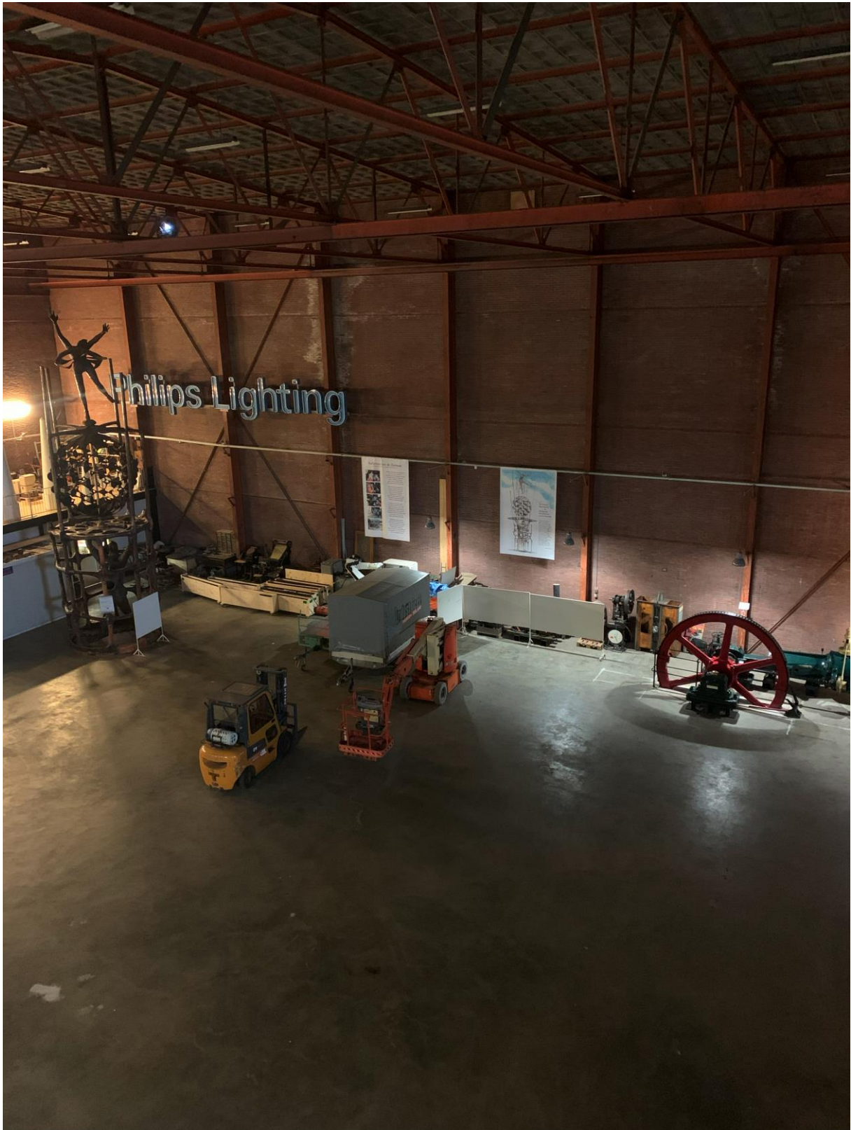
View of Hal 2, inside the Industrial Museum