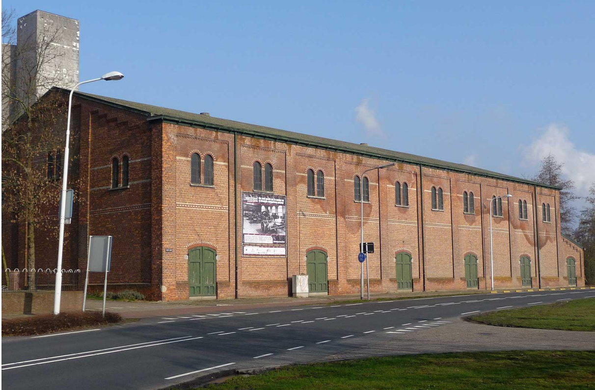
Industrial Museum Zeeland (main exhibition venue and location for urinal installation), based in a former sugar factory