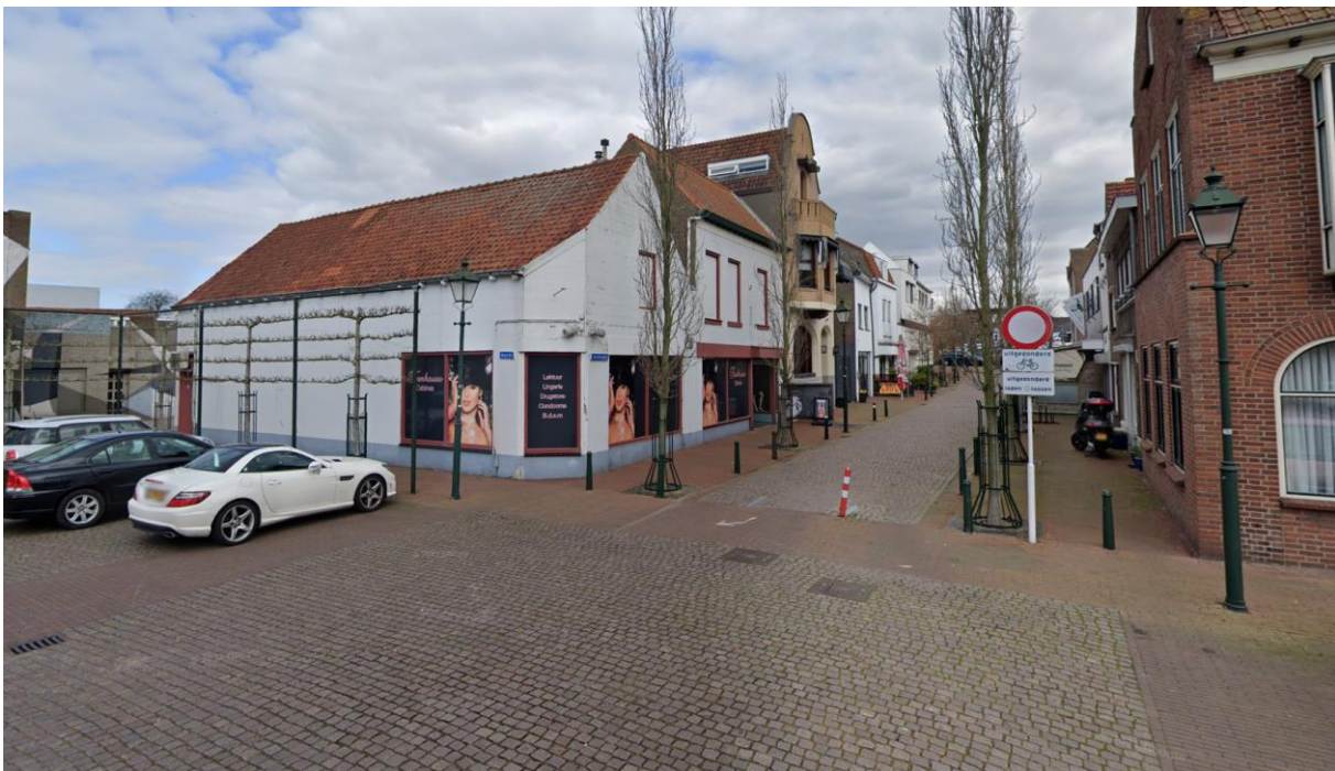
The last remaining sex shop in the centre of Sas van Gent, an industrial town on the Dutch-Belgian border. It has two small cinema rooms (venue for film screening during opening weekend)